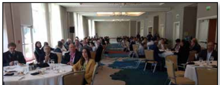
FAP Business Meeting Luncheon